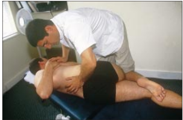
High velocity thrust delivered by a levered thrust, the technique usually used by osteopaths

With the exception of cranial osteopathy, many of the treatment methods used by osteopaths and chiropractors are similar to techniques used by those physiotherapists with additional training in manipulative therapy. From a general