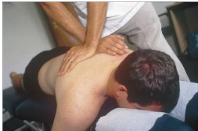
High velocity thrust given as a direct thrust on the spine, as favoured by chiropractors