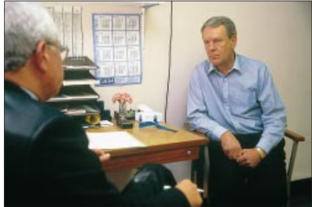
Most patients do not tell their general practitioner if they are using complementary medicine. This may place some at unnecessary risk

Many conventional professionals are concerned that, if complementary treatments are given to patients before a