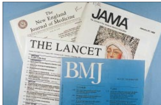
Although doctors may claim to be unaware of published data on complementary medicine, results from many randomised controlled trials of complementary medicine have been published in major, peer reviewed journals