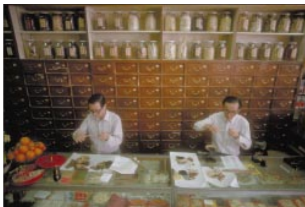
A Chinese herbal pharmacy. As many complementary medicines contain pharmacologically active agents it is important to establish what patients are using in order to minimise the risk of interactions with conventional drugs